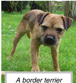
A border terrier

L: Ooooooooh, doggie! Doggie! What kind of dog is it?