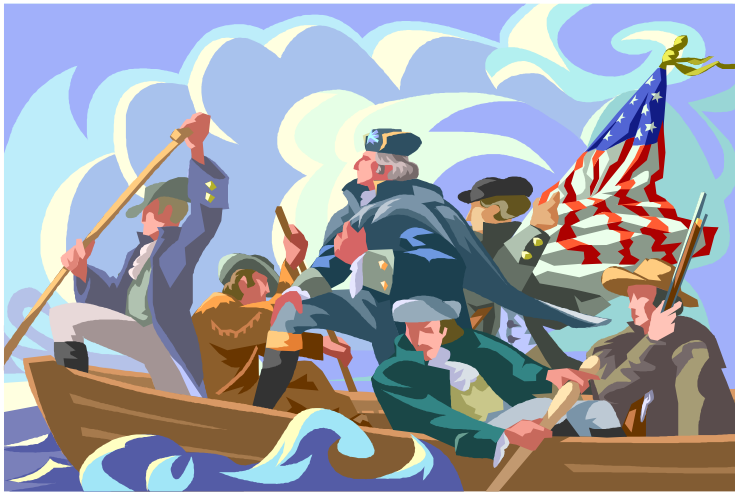
George Washington crossing the Delaware River during the American Revolutionary

We honor George Washington as the first President of the United States. After leading the military campaign to win American independence, Washington played an important role in the new nation's formation. He was the elected leader of the meeting, or convention, that was held to create the Constitution. Later on, Washington's service as the first U.S. President set a tradition for future presidents to follow. For example, he refused to try to become President more than twice. This began the very democratic tradition of a President not serving more than two terms. This limit is now required by a Constitutional Amendment.