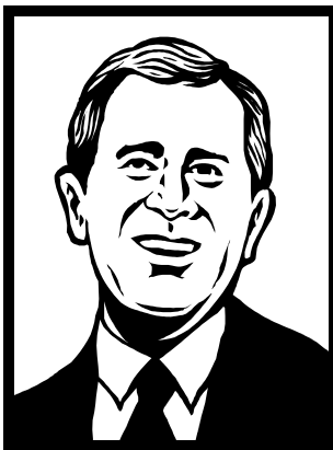
The 43 rd U.S. President George W. Bush 2001-present

Question 13: Who is the President of the United States today?